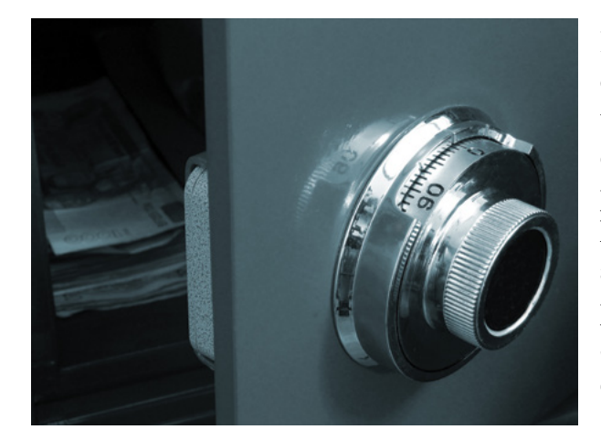
An adequate amount of disability income insurance is like having hundreds of thousands of dollars locked up in a wall safe, ready to use in the event of a disability.

Long Term Disability plans set out with this goal in mind, but these types of plans have a benefit cap which means that higher paid employees or owners will often receive less than 65%. The higher the income, the lower the percentage of income covered! This is referred to as reverse discrimination. Individual disability plans available from the traditional carriers start off insuring around 65% of income, but as income goes up, the percentage of income covered goes down.